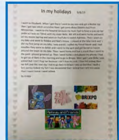
Erikka's holiday reflection