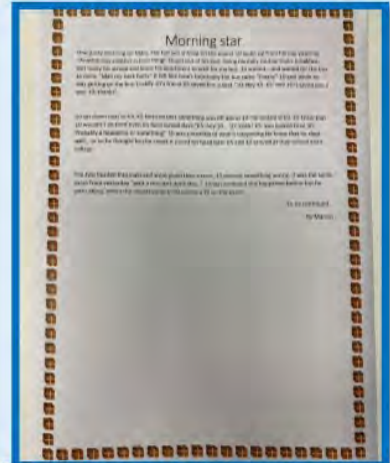
Marcus' narrative story

We have included some of our writing that we have been working on this term. We have been working on re-reading and editing our writing to improve meaning and we have also been working on publishing our writing on the computer and would like to share some of our finished results. You can also see more examples on display in the front office.