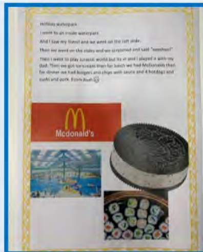
Avah's holiday reflection