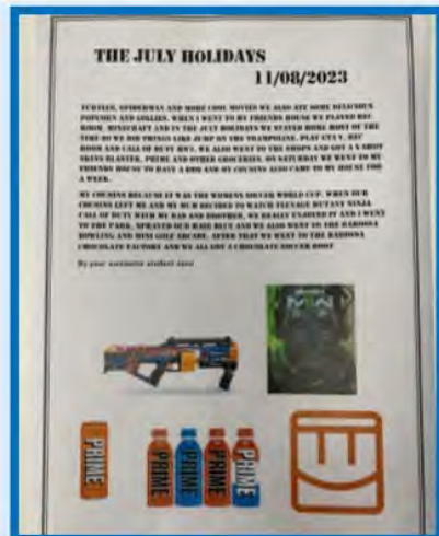
Jano's holiday reflection

We have included some of our writing that we have been working on this term. We have been working on re-reading and editing our writing to improve meaning and we have also been working on publishing our writing on the computer and would like to share some of our finished results. You can also see more examples on display in the front office.