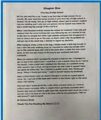
Harmony's narrative story