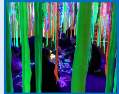
Neon sea lights