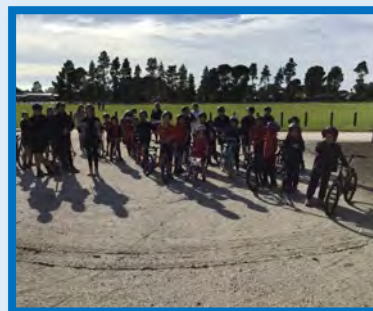
Our Wheels Day crew