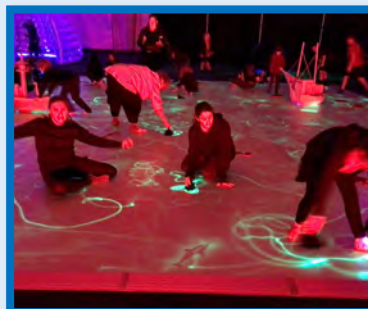
Fun drawing with UV lights