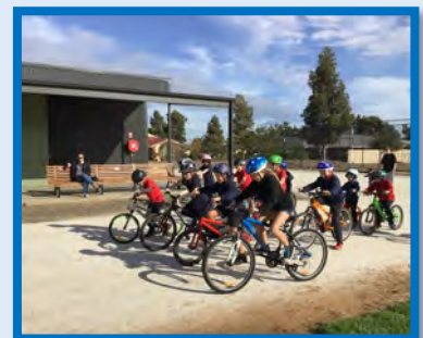
Riders in action

On Friday the 5 th of May we all went to the oval for wheels day, it was really fun. Nearly the whole school went to wheels day, even some people brought their roller skates. We were separated in two groups, the roller skates and scooters had to go on the tennis court and the bikes had to go all around the oval. I was super-fast, I did over 30 laps!