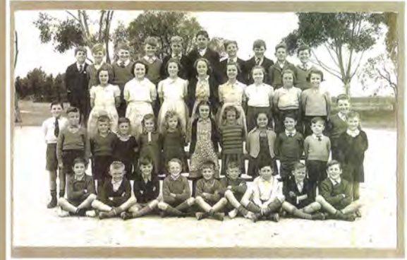
Wasleys Primary 1944 "Whole School Photo"

Watch out for more information coming home on 31/3