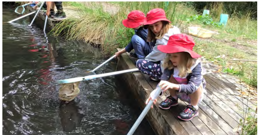
Arbury Park Camp 2023

Government of South Australia Department for Education