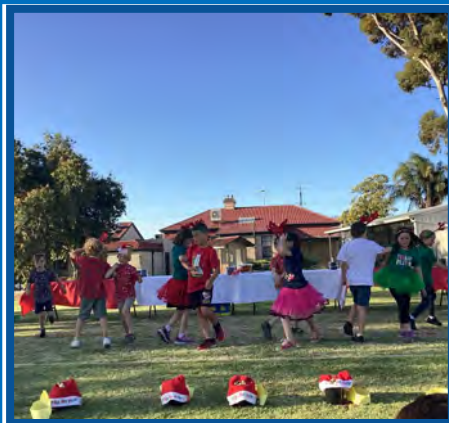
End of Year Concert