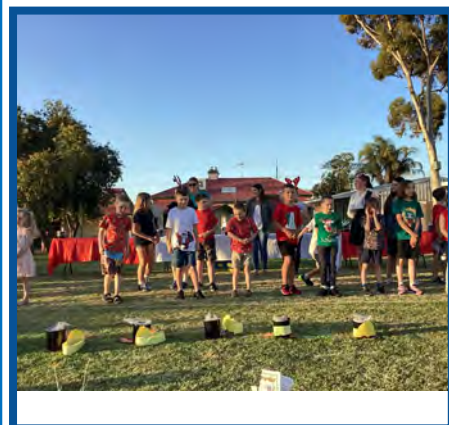
End of Year Concert