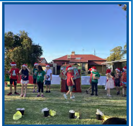
End of Year Concert