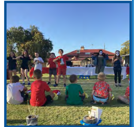
End of Year Concert